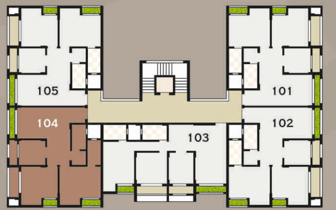
2 BHK FLAT