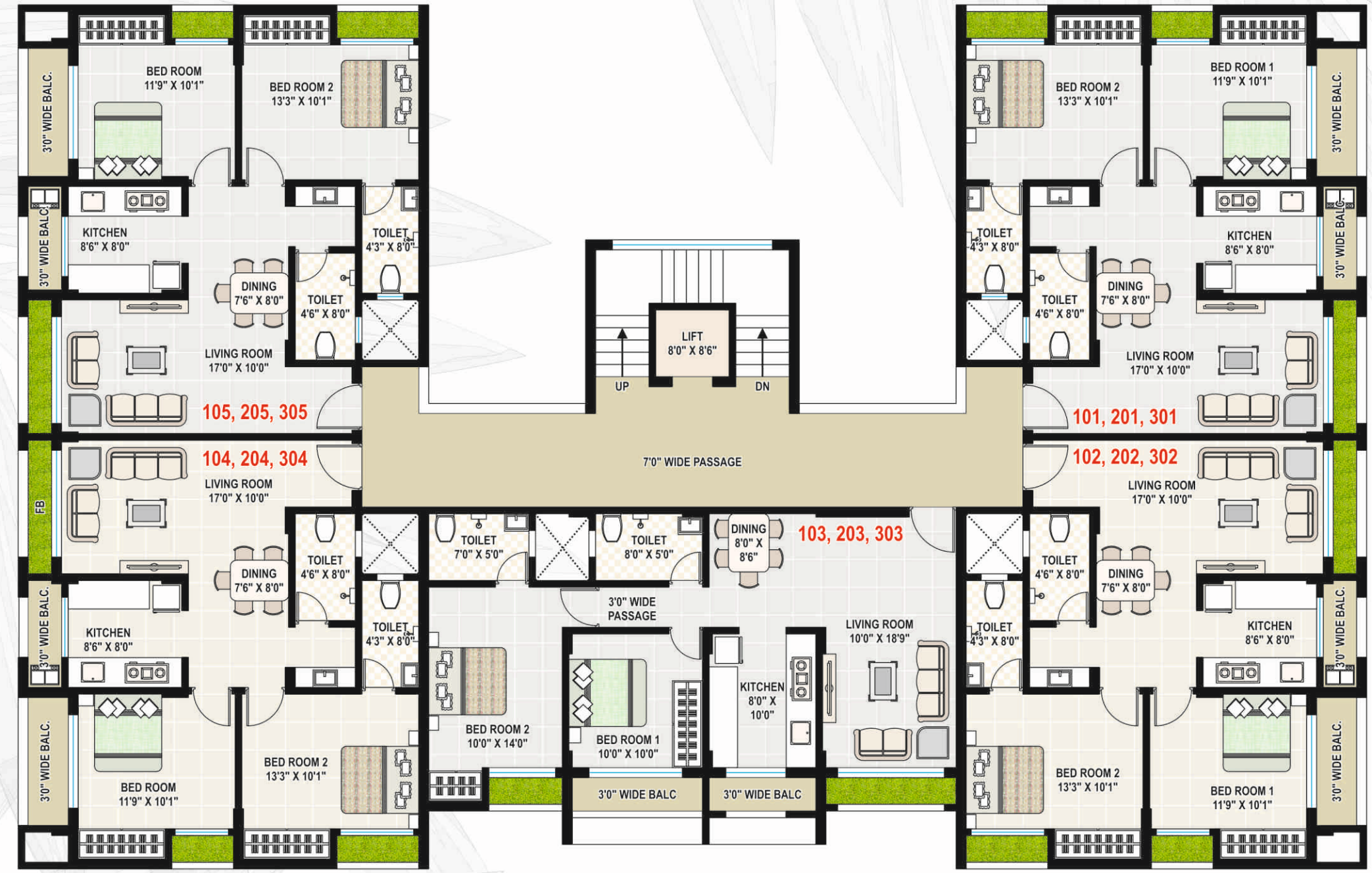
TYPICAL FLOOR PLAN B - BUILDING