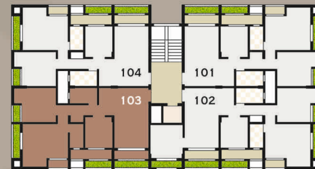
2 BHK FLAT